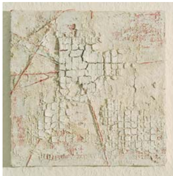
Title (100X100 cm) Mixed Media on canvas, 200?