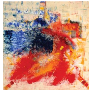
◁ Title (100X100 cm) Mixed Media on canvas 200?